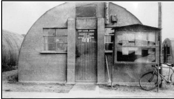
360th BS Orderly Room

Everyone at Molesworth was dedicated to the success of the mission, and all personnel serving in the Ground Support Echelon set high standards to make sure that all the required tasks were performed in a timely manner.