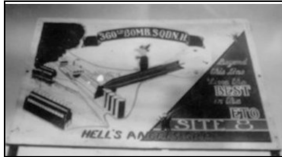
360th BS Headquarters Sign