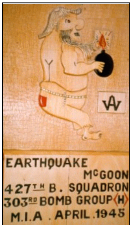
Wood Carving by William F. Adams

Forty aircraft dropped 468 x 250 G.P. bombs, 156 x 500 M-17 Incendiary bombs, plus three units of WG-50 and seven units of T-359 leaflets on the target. In the target area there were 10/10th high clouds, base 21-22,000 feet, dense and persistent contrails at 21,000 feet, and haze which limited air-to-ground visibility to five to eight miles. Due to these weather conditions, the bombing altitudes were 4,000 feet below the briefed altitudes and the lead and high Squadron used H2X. Results were poor for the lead, fair to good for the low, and undetermined for the high Squadron. Aircraft #44-85534 brought its bombs back. Its bomb bay doors sustained battle damage and wouldn't open.