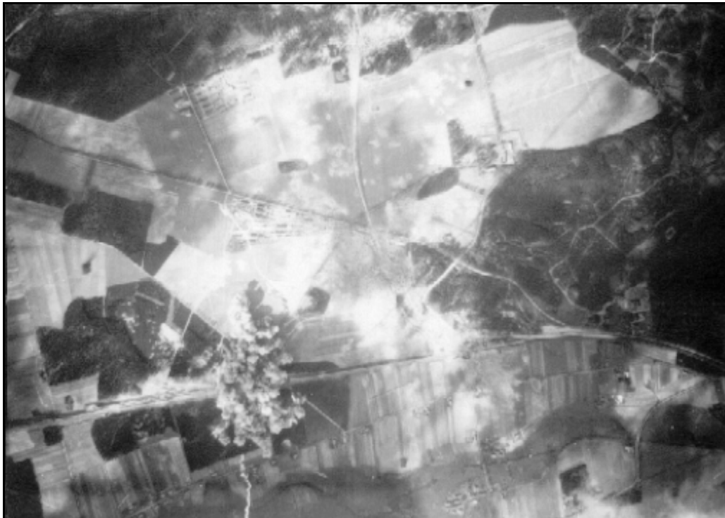
Bomb Strike on Hitzacker, Germany

Thirty-eight of the 39 dispatched B-17s bombed the first priority target visually. Dropped were 366 500-lb. G.P. bombs and 10 units of leaflets. The lead and low Squadrons hit across from the marshalling yard. The high Squadron hit close to the assigned MPI, but most bombs were short of the target area. Overall results were excellent. One aircraft dropped one 500-lb. G.P. bomb on the Ulren marshalling yards as a target of opportunity. In the target area there were 5/10 to 7/10 low clouds with tops at 6,000 ft. and air-to-ground visibility was 10-15 miles, making it necessary to make several bomb runs on the target.