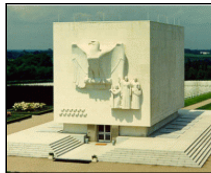
Ardennes American Cemetery Memorial