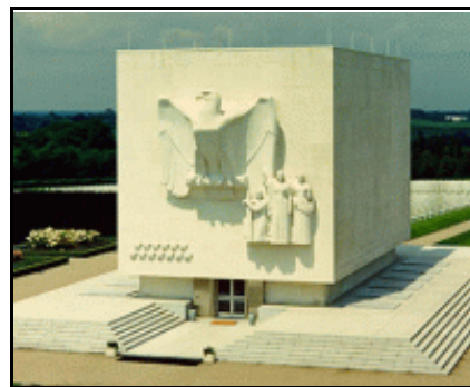
Ardennes American Cemetery Memorial