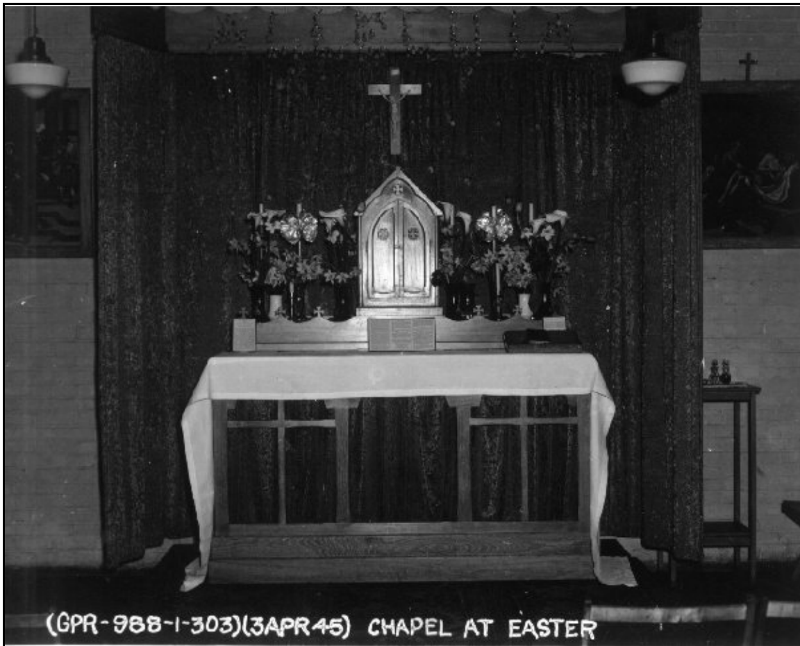
Molesworth Chapel at Easter 1945