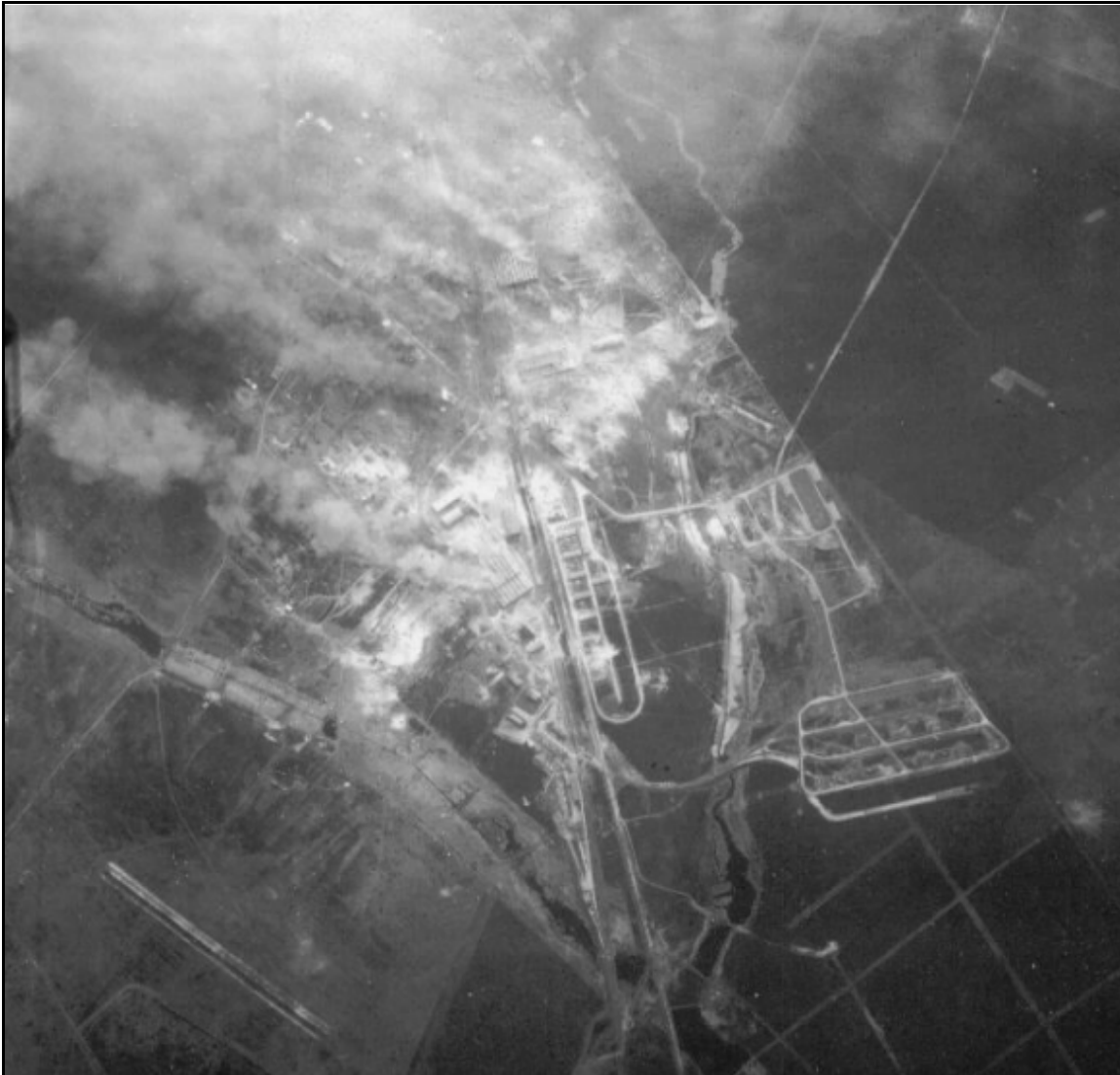
Bomb Strike on Unterluss, Germany