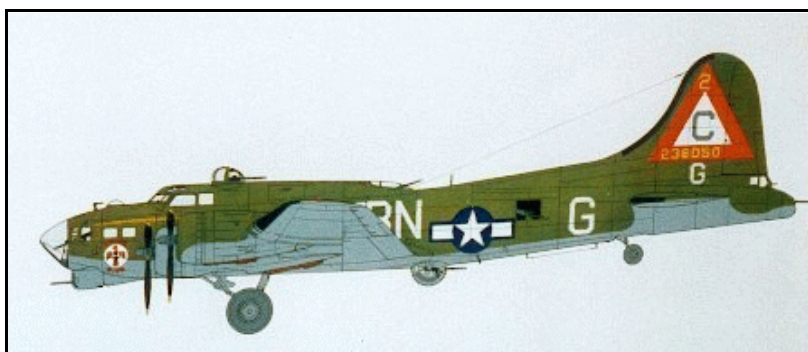
B-17G #42-38050 Thunderbird by an unknown artist. The Aircraft Letter "U" was changed to "G" after she was retired.

Thirty-nine 303rd BG(H) B-17s dropped 469 100-lb. H.E. M30, 220 260-lb. M81 fragmentation, 50 500-lb. M17 incendiary and 10 500-lb. RDX incendiary bombs, and ten leaflet units on the first priority target. There were no clouds in the target area, but there the considerable haze hindered visibility and obscured the