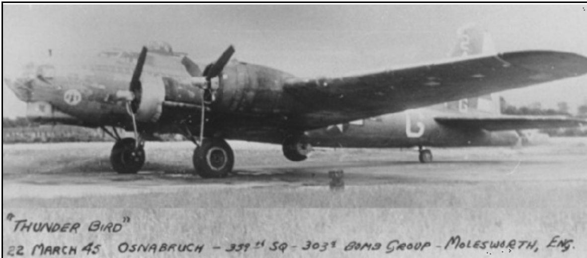
Poor old "Thunderbird" looked terrible when she retired. She had been the first un-camouflaged B-17 to arrive at the 303rd. For fear of drawing German attention, she was painted olive drab and gray without the benefit of a primer coat. Much of the paint had worn off the nose. She had an unpainted cowling for #2 engine was covered with patches. Her individual aircraft letter "U" was changed to "G" after she was parked.