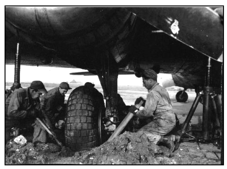
Ground crewmen digging a B-17 out of the mud.

Thirty-six B-17s dropped 627 500-lb. H.E. M43 bombs and 10 units of leaflets on the secondary target. Bombing was by PFF through practically solid undercast. Results were generally unobserved with a few reports of bombs hitting in the city. One aircraft jettisoned its bombs. In the target area there were 8/10 middle clouds with tops at 11,000 feet. Visual bombing could not be attempted. The low Squadron bombed on the 457BG (3rd AD) when the lead aircraft PFF failed.