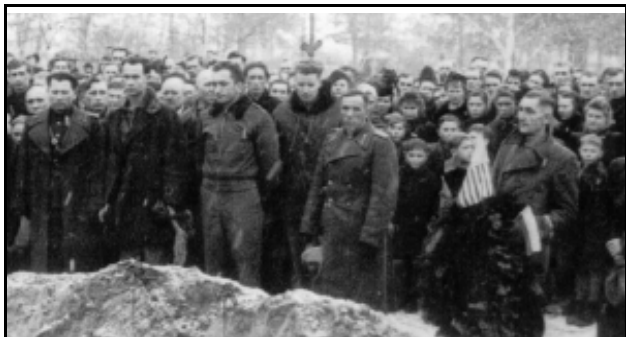
A large crowd at the funeral for the crewmen of Poque Ma Hone.