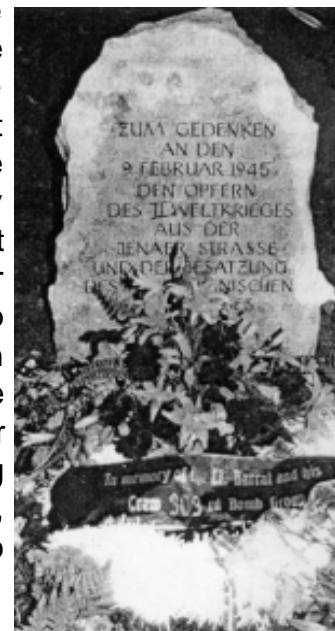
Memorial to Barrat Crew

Another miracle was reported in 1991 by German eye witnesses to the crash of #43-39149. It was seen heading for the center of the village of Eisenburg. Just before it would have crashed into the city, killing hundreds of people with its intact armed bomb load, Pilots Barrat and Harvey managed to level the B-17 and dropped their bombs on a field outside the village. Only one house was hit by a bomb that killed 10 people. The aircraft then crashed and exploded in a wooden area near Eisenburg/Thuringen, Germany. In October, 1991, a group located the crash site, recovering parts of the aircraft and human remains of the crew members. A golden wedding band with the initials "MN to PB 1944" was found which belonged to Navigator F/O Shirl P. Best . Another ring with the initials "R.J.B.," belonging to Pilot 2Lt. Robert J. Barrat , also was found. On September 7, 1995 villagers erected a memorial to crew members who reportedly gave their lives to save hundreds of villagers.