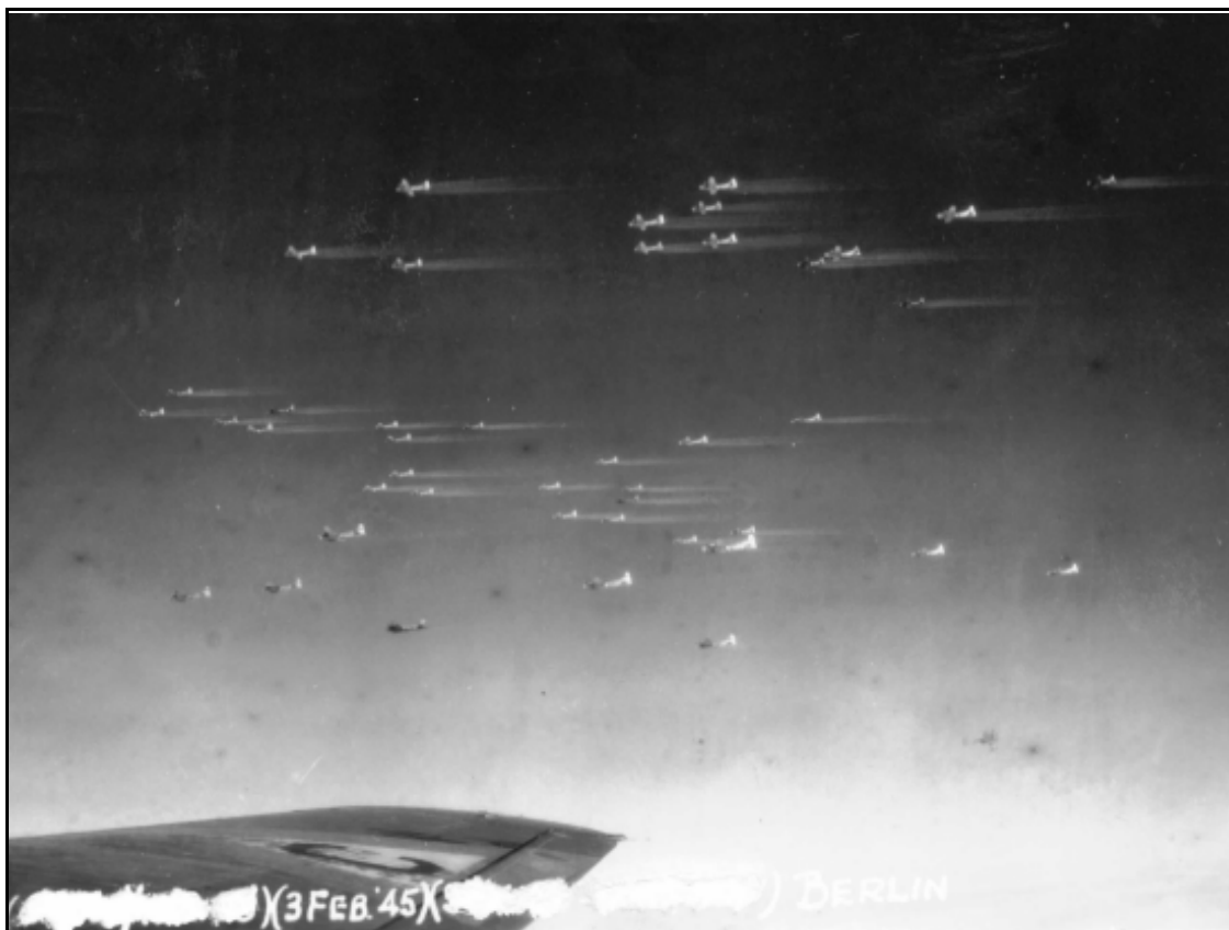
View of another Bomb Group from a 303rd BG Aircraft