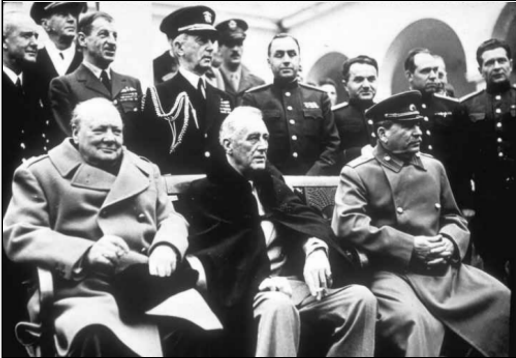
At the Yalta Conference - Winston Churchill, President F.D. Roosevelt, Josef Stalin