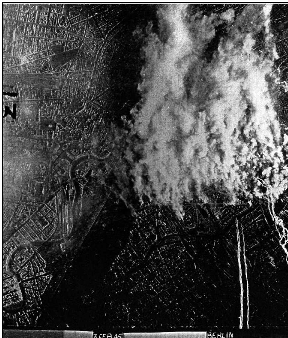
Berlin from 25,000 feet - 3 February 1945

Healy-Hullar 038 - PFF Ashwell 081 Aagesen 545 - PFF Wertz 977 Richter 885 Bean 060 Petersen 621 Middlemas 672 Demian 860 Flanders 411 Schultz 318 Ayers 011 Moody 451