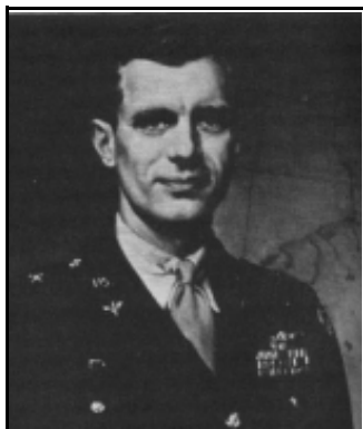
General Frederick W. Castle

Facing zero visibility caused by low clouds and fog at Molesworth, returning 303rd BG(H) aircraft landed at Snetterton Heath (96thBG airfield).