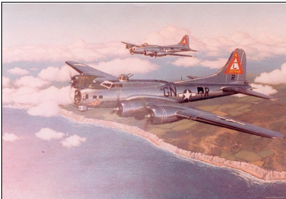
Miss Lace and Earthquake McGoon

High winds interfered with the mission being flown as briefed. The entire Group had problems converging and ended up assembling over a wide area.