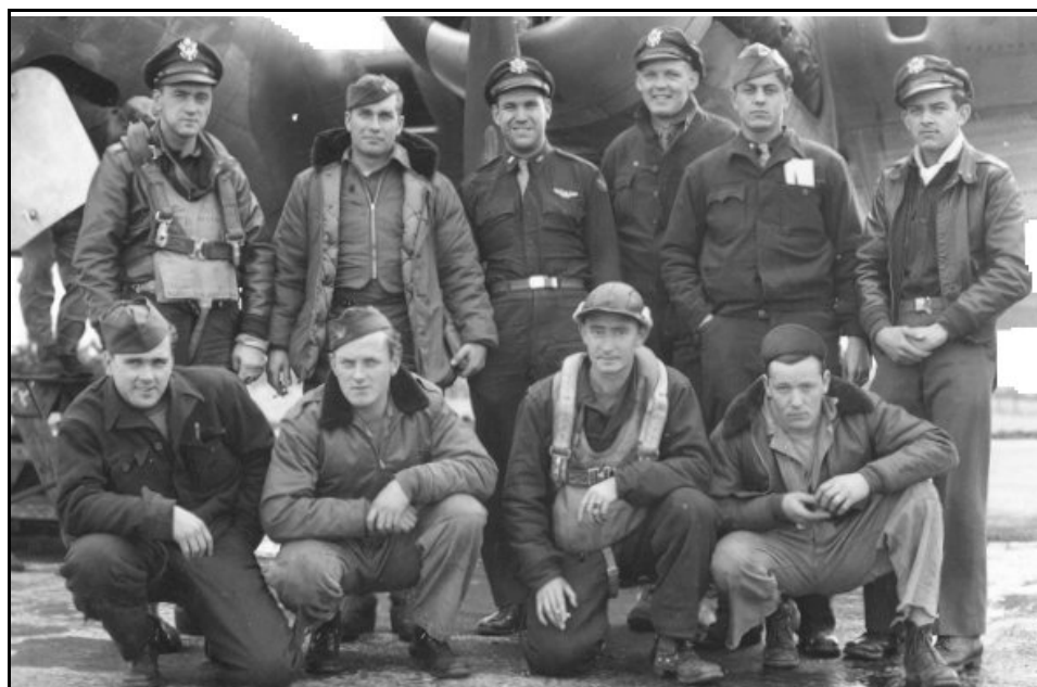
B-17G The Red #44-6166 (427BS) GN-V

Thirty-six Fortresses dropped 360 500-lb. G.P. bombs from 26,950, 25,900 and 24,800 ft. The bombing was by GEE-H equipment through solid overcast, with tops at 10,000 to 12,000 feet, and results were unobserved. Indications were that the lead Squadron hit quite a distance from the target due to equipment failure and that the low and high Squadrons hit near the target. No enemy aircraft were seen. Friendly fighter support was scattered going into the target, but was good from the target and out. Moderate and accurate flak were encountered with chaff having little beneficial effect. Thirteen aircraft sustained major and eleven, minor battle damage. Four crewmen were wounded.