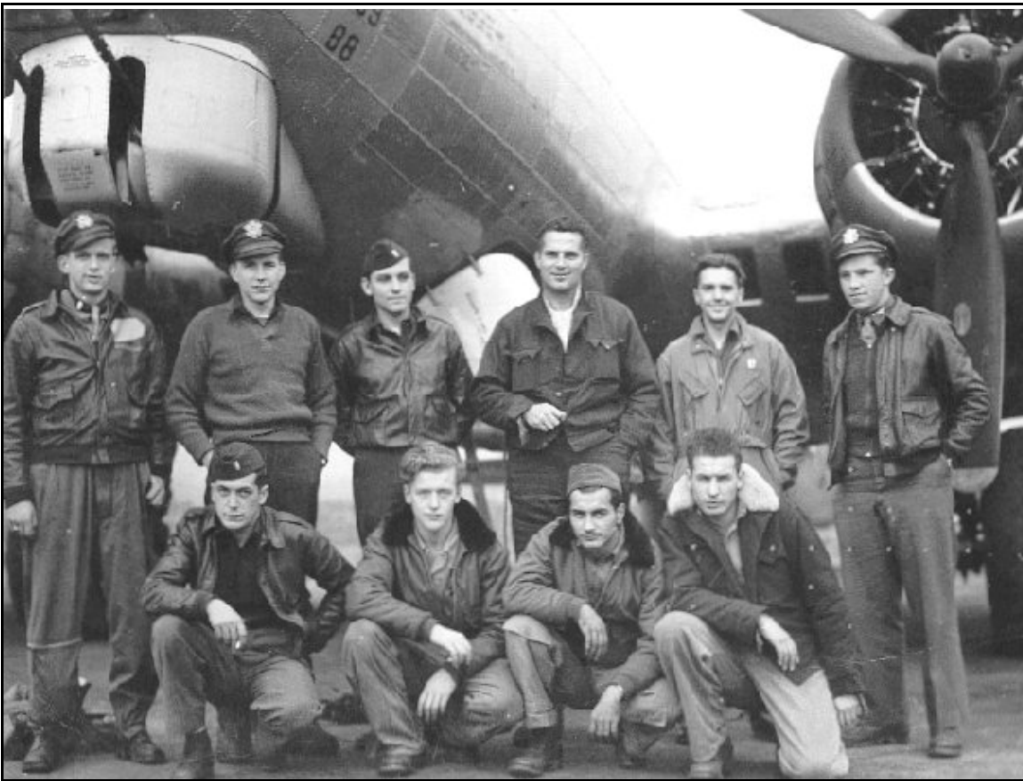
(no name) #44-8137 (359BS) PFF BN-Z