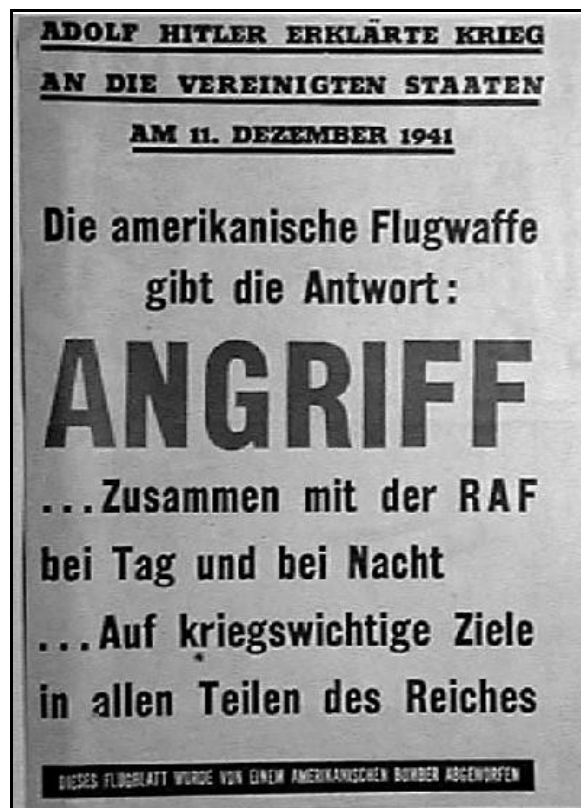
Leaflet Dropped from B-17s