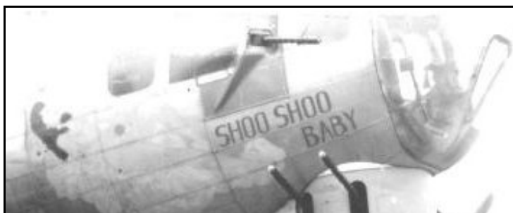
Nose Art on B-17G #42-97311 Shoo Shoo Baby 427BS (GN-O)