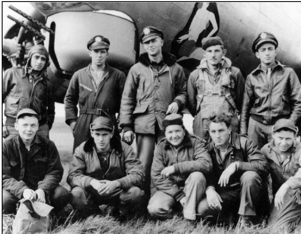
Heller's Angel #42-102484 (359BS) BN-K