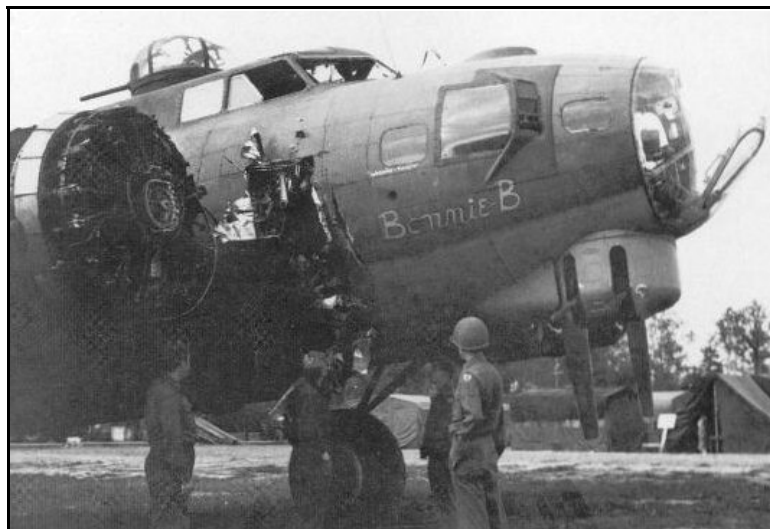
Battle Damage to B-17G #42-31483 Bonnie B 359BS (BN-P)

Thirty-six 303rd BG(H) B-17s dropped 214 1,000-lb. G.P. M44 bombs and eight sky markers on the target from 26,000, 25,400 and 24,500 ft. There were solid, low clouds with tops at 15,000 ft. right up to the edge of the target. Weather then broke fairly clear, but the persistent contrails up to 23,000 ft. necessitated PFF bombing. Results were unobserved, but were believed good. B-17 #42-97949 ( No Name ), 358BS (Lt. Whitlock , 359BS), dropped six 1,000 lb. G.P. bombs on Nockenheim, Germany, as a target of opportunity. B-17 #42-107206 Old Black Magic , 359BS (Lt. Frazier ) did not bomb because the electric bomb release failed and the mechanical release was improperly used. Bombs were returned to Molesworth.