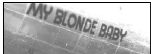
B-17G #42-6086 My Blonde Baby 358BS (VK-L)