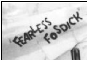
Fearless Fosdick Nose Art