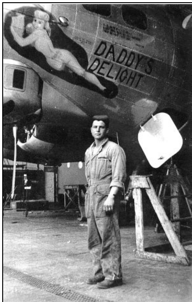
B-17G #42-97944 Daddy's Delight 359BS (BN-1) with unknown ground crewman

T hirty-nine 303rd BG(H) B-17s, plus two PFF aircraft, took off to attack an aircraft engine plant at Allach, near Munich, Germany. Military installations at Augsburg were the target if PFF bombing was required. The secondary target was the Lechfield airfield, with various other German locations as the last resort targets. In addition, three 303rd BG(H) aircraft flew in the high flight, high Group of the 41 CBW-B formation with its primary target the air depot and airfield at Erding, Germany.