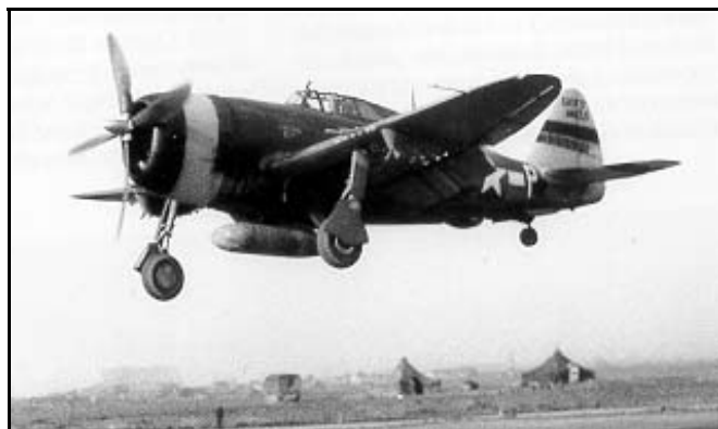
Republic P-47 Thunderbolt

Other 8th Air Force Groups had mixed results. The 2nd Division arrived first, found 10/10 clouds, and returned without bombing. The 3rd Division was the next to arrive and thirty-five 388BG aircraft managed to drop their bombs – after making three bomb runs looking for a hole in the clouds. All other 3rd Division Groups failed to bomb. The 1st Division was the last to arrive and found broken clouds. Only 317 aircraft were able to bomb. Other 1st Division Groups received a recall signal and retained their bombs.