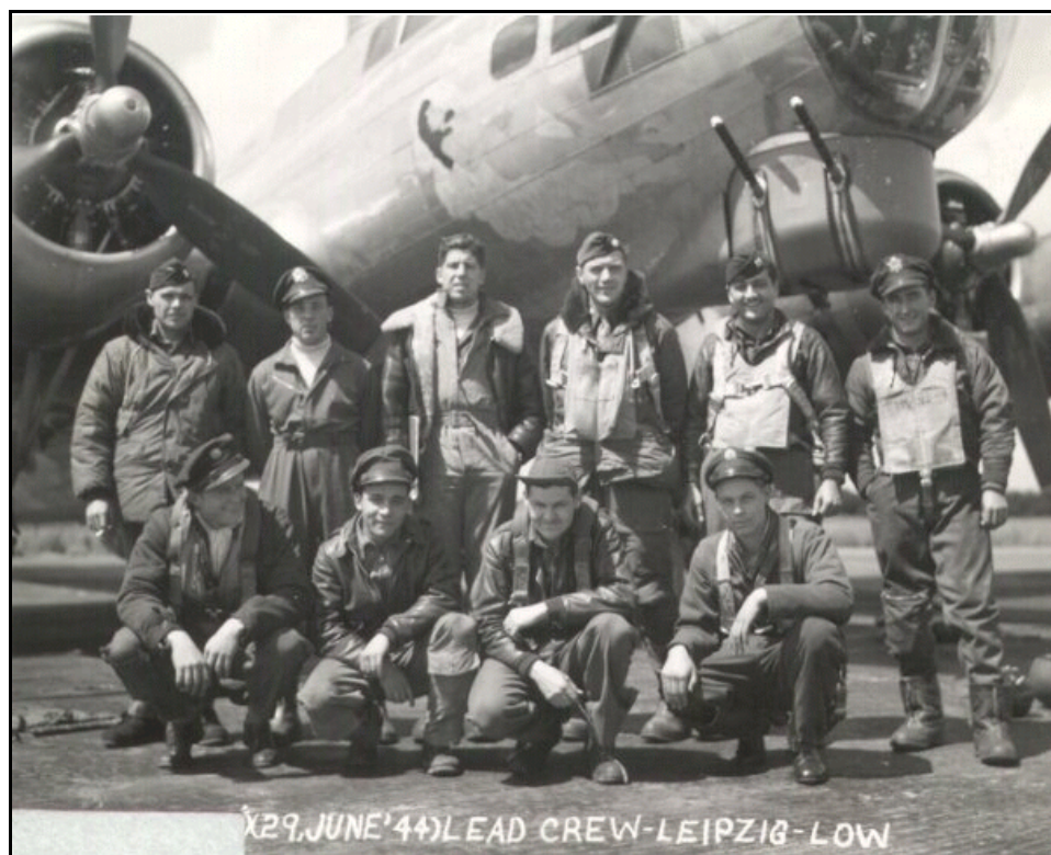
X29, JUNE '44) LEAD CREW - LEIPZIG - LOW