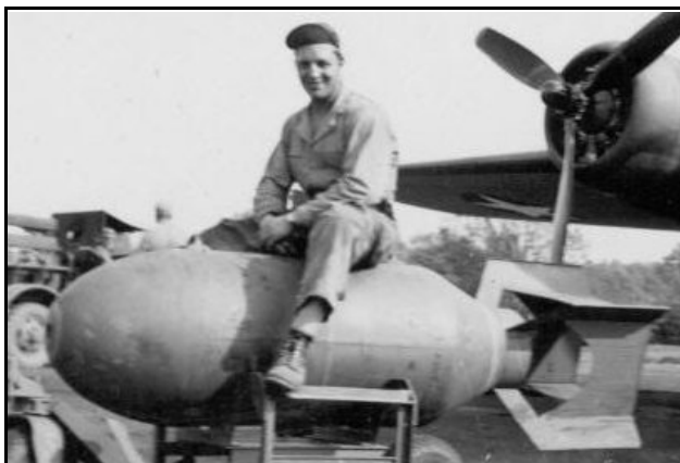
Unknown 359th BS Ground Crewman on a 2000 LB Bomb

Again we are doing tactical work to "No Ball" targets trying to slow the rate of Buzz Bomb launches. My diary for the day reads: "St. Omar, France. (Calais area) robot plane installations. Flew low squadron lead. Flak meager, but VERY accurate. Lost two ships, one was leader. Three tenths CAVU. Only 14 went out...Rough!"