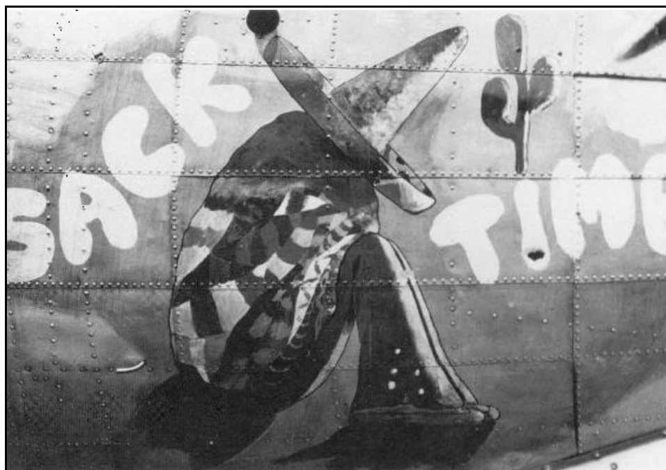
Nose Art on B-17G #42-102544 Sack Time 360BS (PU-K)