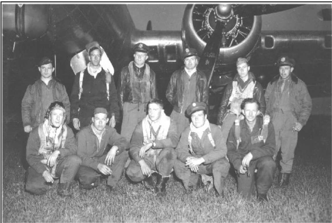
Queenie #42-97281 (427BS) GN-Q