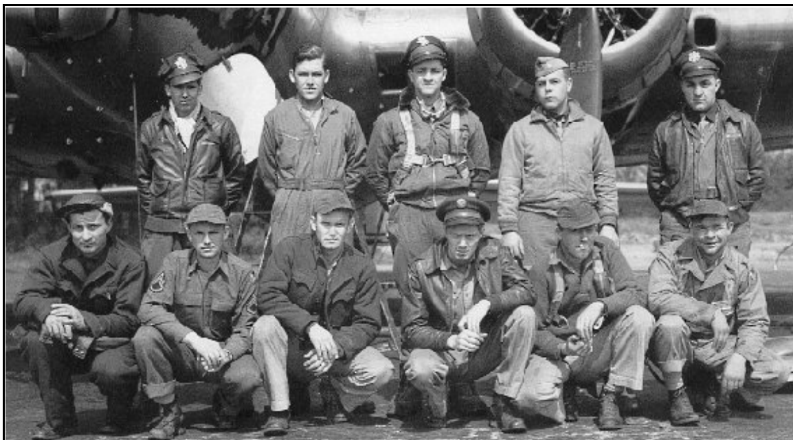
Scorchy II #42-97058 (359BS) BN-V