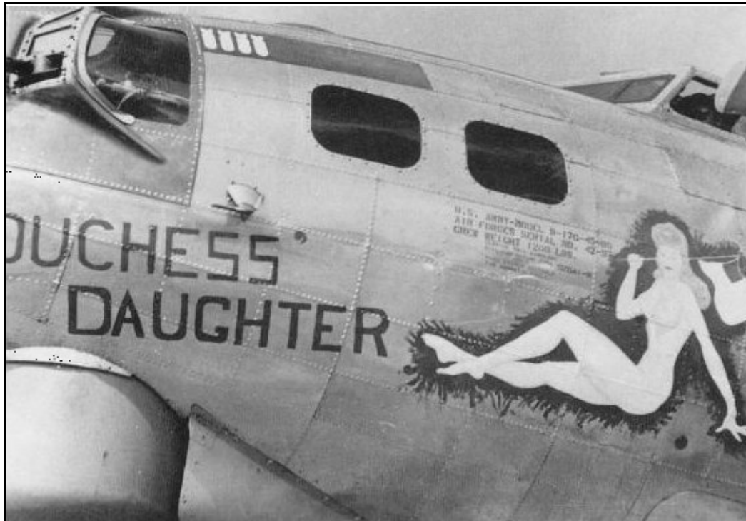
Nose Art B-17G #42-97272 Duchess' Daughter (359BS) BN-T

This was my 23rd mission and it was probably one of my worst ones. We were headed for Berlin again, but this time we lost No 2 engine on 42-97272 "Duchess Daughter" out around Hannover, and had to turn around and head home. This was a 359th Bomb Squadron aircraft that was borrowed for this mission.