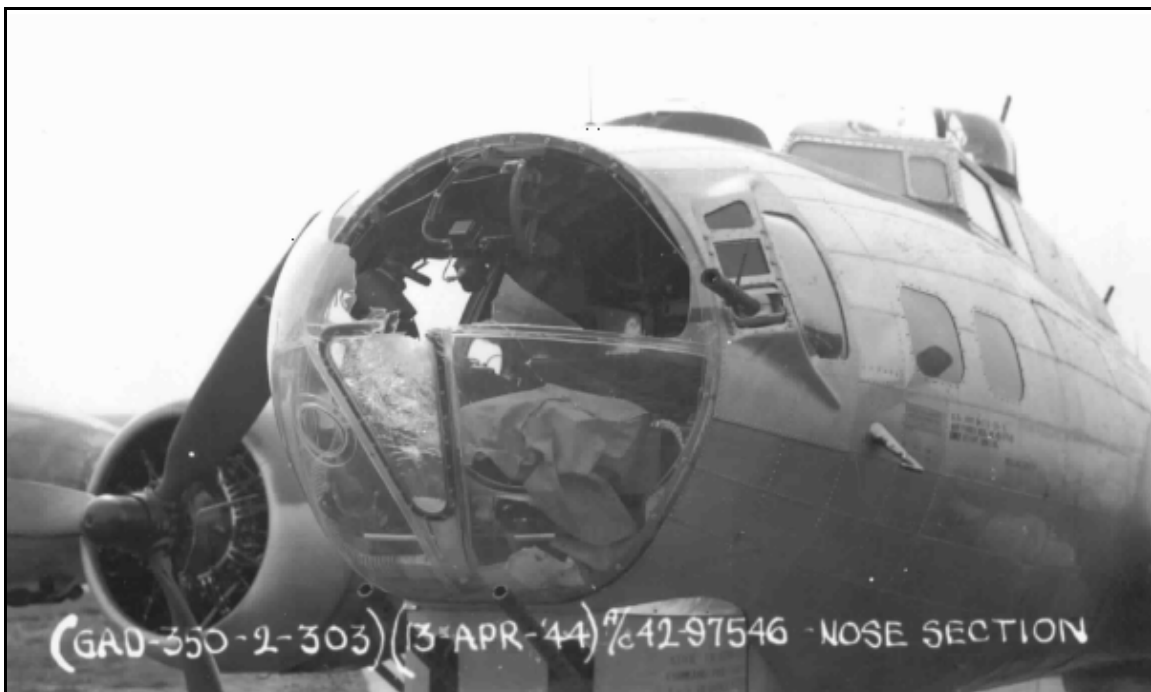
B-17G #42-97546 Idaliza 360BS (PU-E) after the nose section was blown out on 13 April 1944