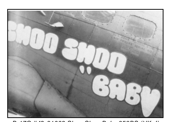
B-17G #42-31669 Shoo Shoo Baby 358BS (VK-J)

The Group again encountered little opposition. The flak was meager and four aircraft had minor damage. From 20 to 25 enemy fighters were seen, but there were no attacks. Due to the extremely poor visibility at Molesworth upon return, five aircraft landed at other bases and then flew to Molesworth during the late afternoon. There were no casualties.