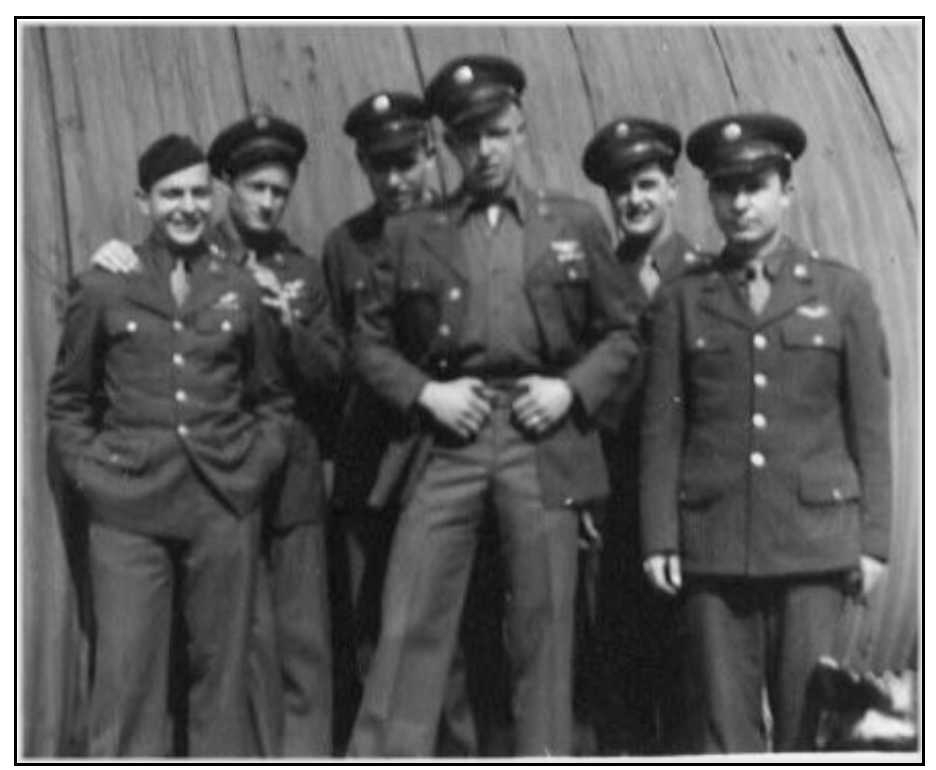
Thunderbird Crew Enlisted Men

At the coast the base of the clouds was 800 feet. By the time we finally got to our base, we were flying at 120 feet above the ground and had very little or no visibility. We were actually feeling our way over the tops of the trees and low hills. As we were circling our field at about 100 feet in an attempt to find a runway on which to land, we were almost run over by three B-17s that were flying around the field in the wrong direction. That was the nearest we ever came to "getting it" in bad weather. I don't believe we could ever have been that lucky again. Just a short time before this, we were almost run over by a B-24. We received no battle damage and no crew member was injured, though we saw about twenty German fighters under us at one time.