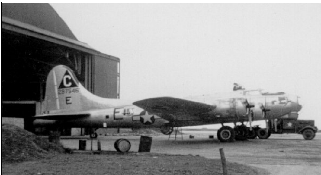
B-17G #42-97546 Idaliza (360BS) PU-E