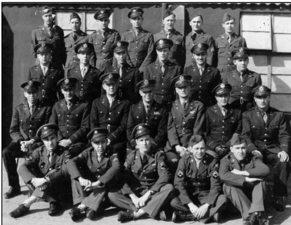
303rd S-2 Intelligence Personnel