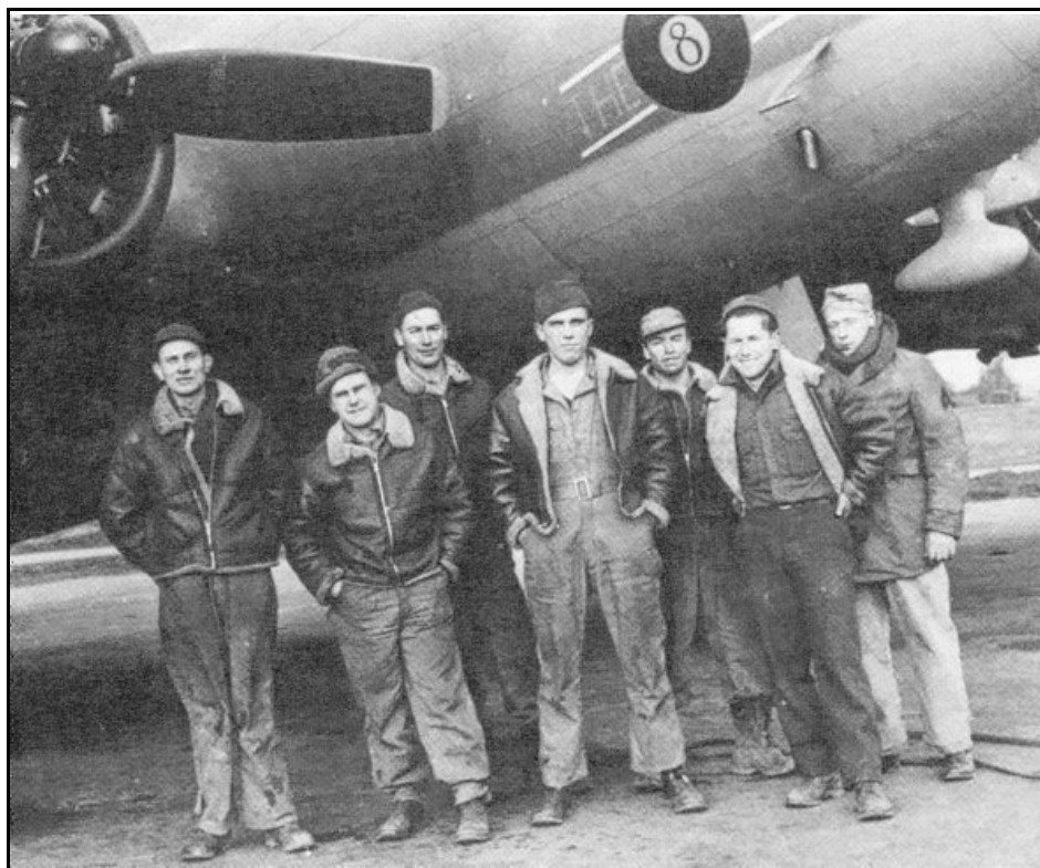
'8' Ball Mk II Ground Crew B-17F #41-24635 359BS (BN-O)