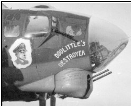
B-17G #42-31471 Doolittle's Destroyer 360BS (PU-E)

Flak was meager to moderate and inaccurate. Enemy air opposition was weak— from eight to ten were seen and only two crews reported attacks. For the most part, enemy aircraft concentrated on the stragglers. There were no enemy aircraft claims by the 303rd BG(H). Fighter support was reported to be excellent, effective and complete support was given the entire time that the Group was over enemy territory. Several crews reported rockets fired from the ground. There was only a trace of clouds at the target and visibility was unlimited.