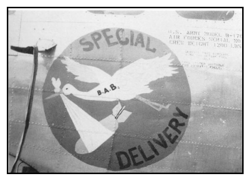
Big A Bird #42-39810 aka Special Delivery

Big A Bird #42-39810, 358BS-E, piloted by 2Lt. Joe Worthley, had numerous problems. Two engines were shot out a few seconds after bombs away. They were unable to keep up with the formation or maintain altitude. None of their gun turrets had power. Fortunately they had no enemy fighters around. Knowing that they had a fuel shortage they tried to reach the RAF emergency field at West Malling. They assumed crash landing positions in the radio room since they were too low to bail out. The two remaining engines cut out and the Fortress