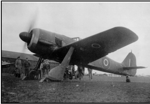
German FW-190 Fighter

Position: No. 3, Low Squadron, High Group