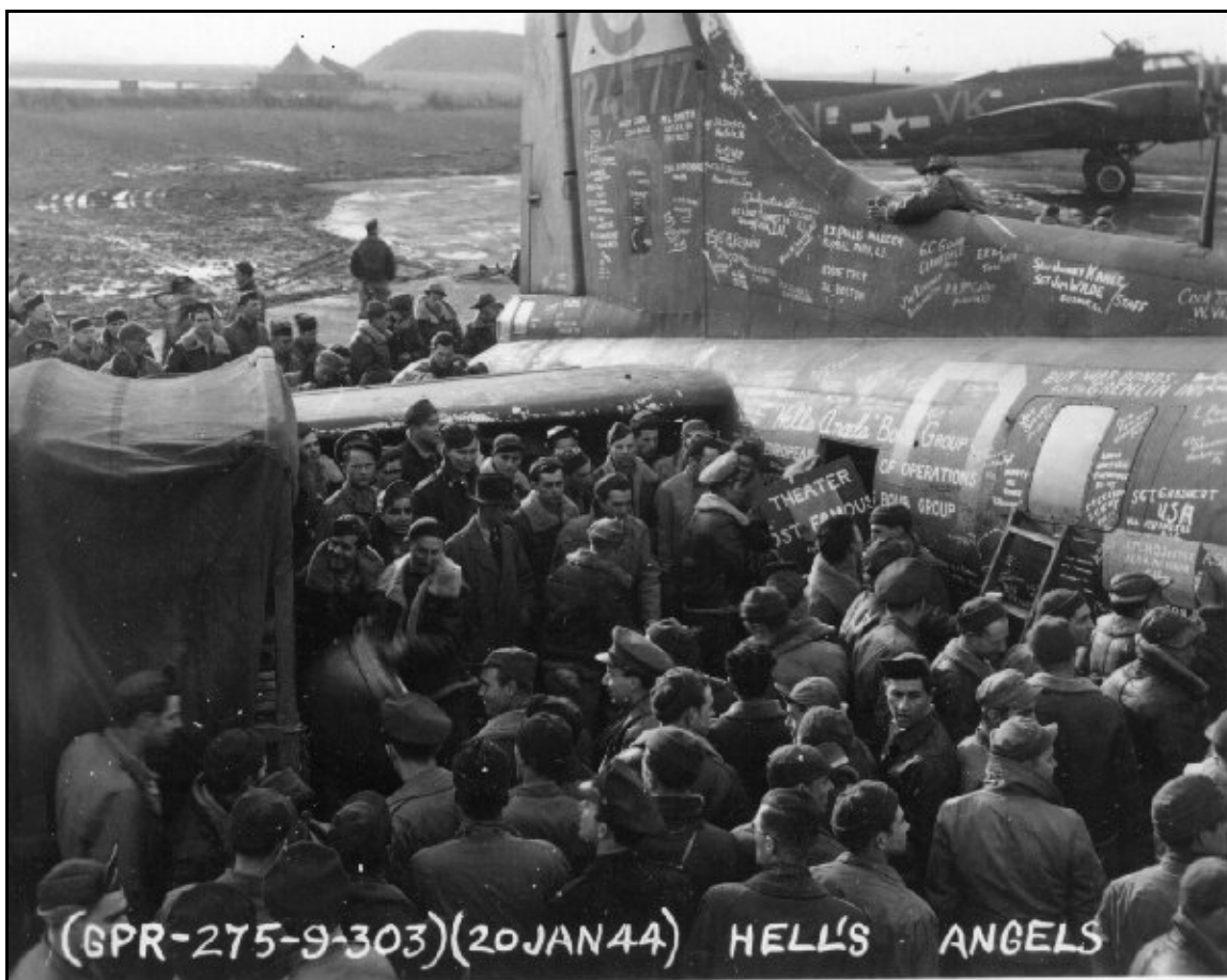
20 January 1944 - B17F #41-24577 Hell's Angels Returned to the USA

The 303rd BG(H)'s most famous aircraft returned to the USA under an archway of flares fired by an outpouring of 303rd Bomb Group members who stayed behind to continue the fight against the Nazi war machine.