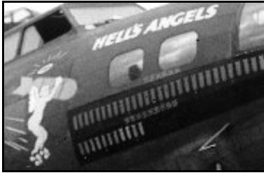
#41-24577 Hell's Angels 358BS (VK-D)

The original 303rd crews received new B-17F aircraft at Kellogg Field, MI and were given the opportunity to name their new Flying Fortresses. The flights to Gander Field, NF allowed crews to check their aircraft for deficiencies before making the over-the-water flight to the UK.