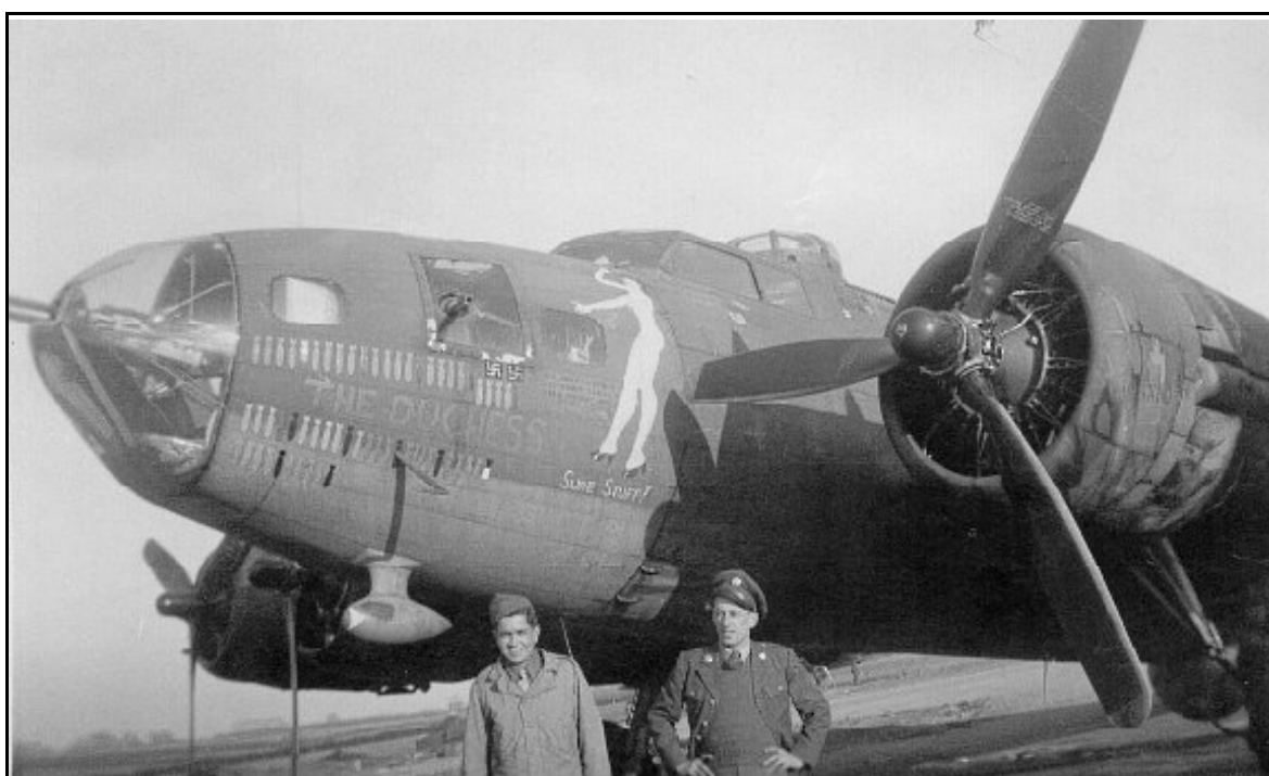
B-17F #41-24561 The Duchess - (crewmen unknown)

The Fortress Knockout Dropper completed its 60th mission while The Duchess (a replacement ship) reached the fifty mark.