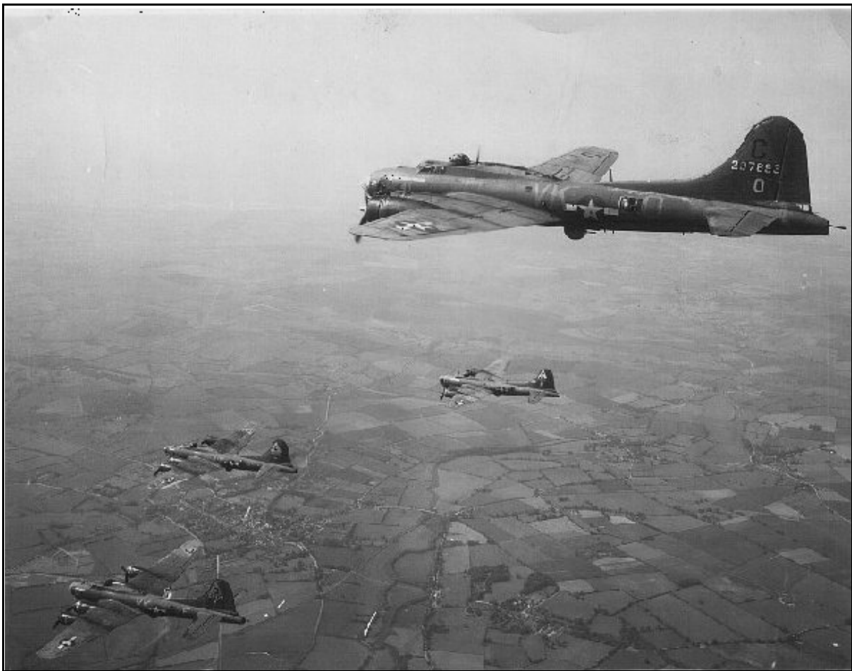
B-17G #42-37893 Bam Bam 358BS (VK-O) in flight (mission unknown)