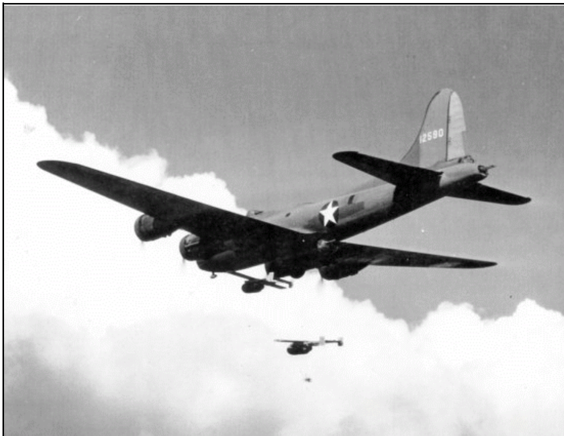
Glide Bomb Training in the USA

Twenty aircraft took off. The 1st Bombardment Division formations flew to the vicinity of the enemy coast, but abandoned the mission because of heavy clouds that extended up to 32,000 ft. The aircraft took off at 1130 and returned at 15 10 hours.