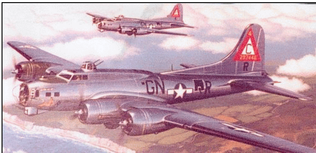
B-17G - NATURAL METAL FINISH FUSELAGE LETTERING CHANGED TO BLACK

In October, the factory no longer applied camouflage to the combat aircraft. With the return of the natural silver, the radio call letters on the sides of the B-17s were changed from yellow to black. Dark olive paint was applied in front of the cockpit and on the engine cowlings for anti-glare purposes.