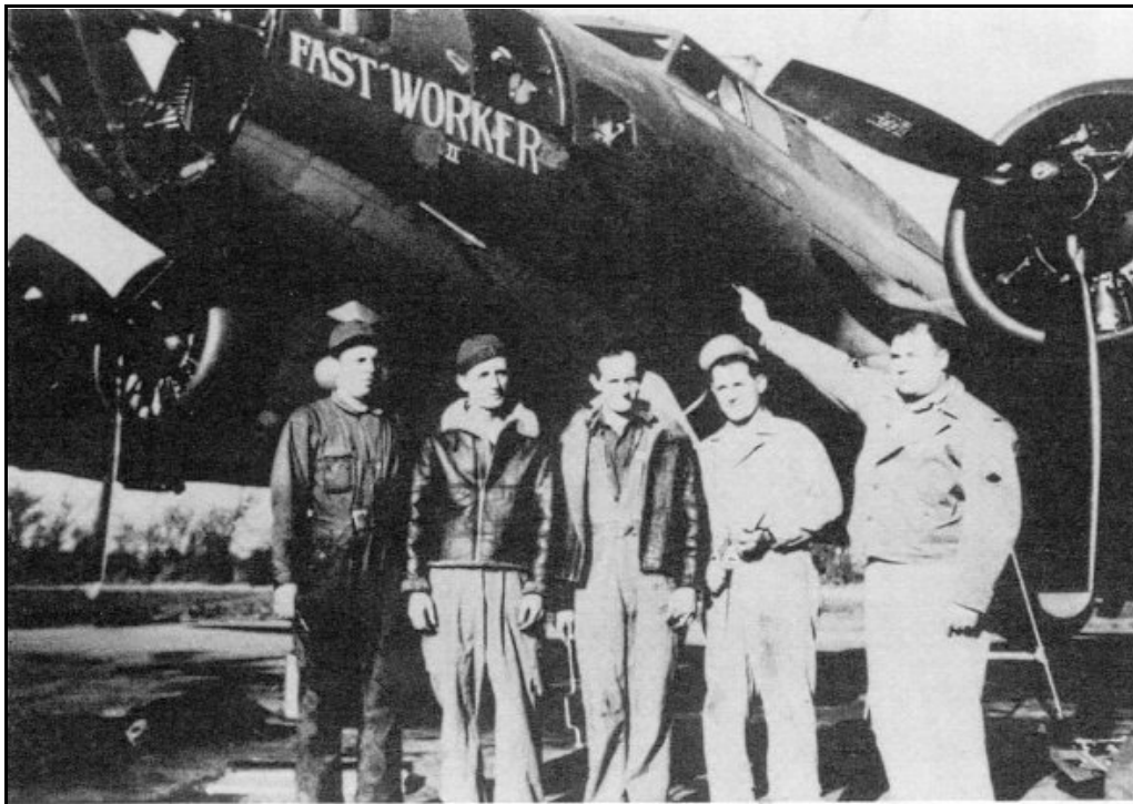
Fast Worker II Ground Crew B-17F #42-5177 359BS (BN-U)