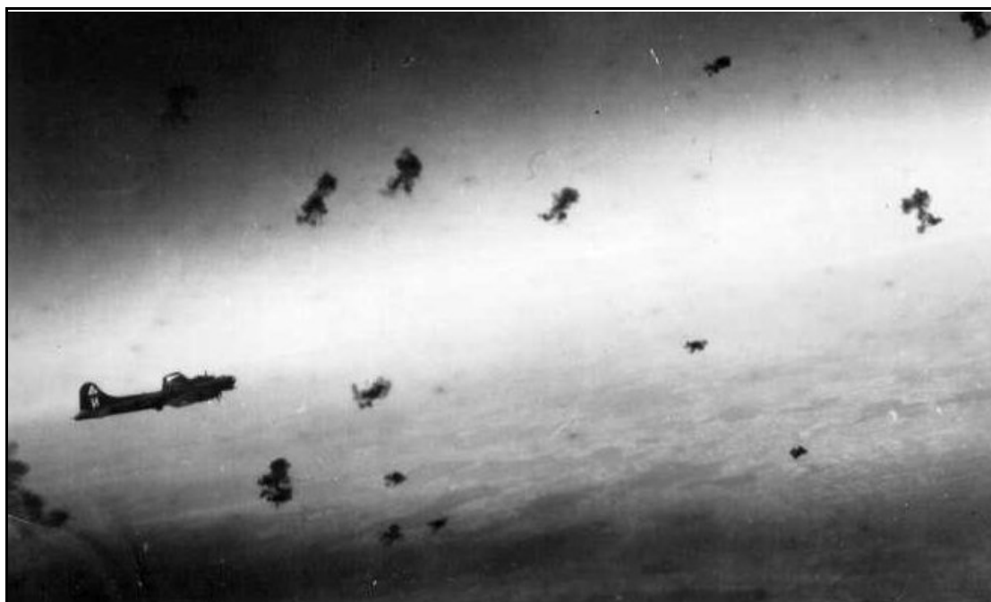
Flak bursting around an unknown B-17