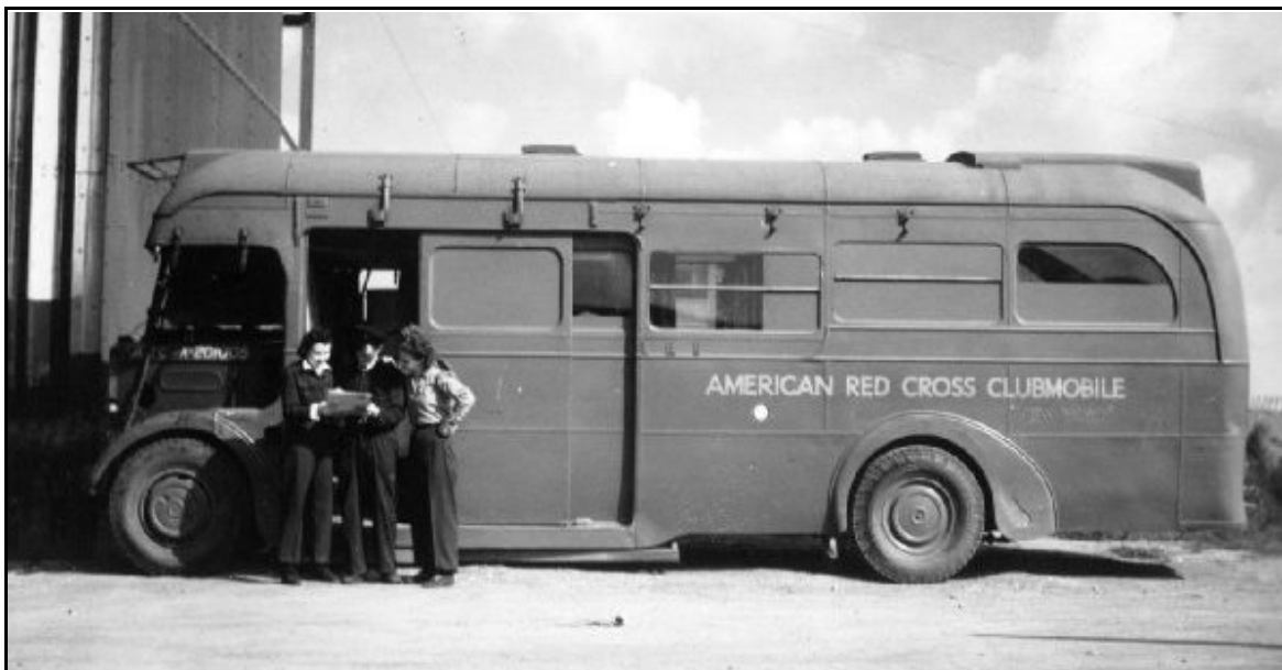
American Red Cross Clubmobile visiting Molesworth. It was always welcome with its coffee, donuts and conversation with pretty Red Cross Girls.

The Heroya, Norway mission--over 2,000 miles round trip--was a classic "textbook" mission. It was one of the most successful missions of the war. The plant, considered essential to the German war effort had just been completed. The dedication ceremony was taking place as the bombs began to drop. Destruction was so complete that the plant never opened. Many top-ranking German and Norwegian collaborators attending the dedication ceremony were killed.