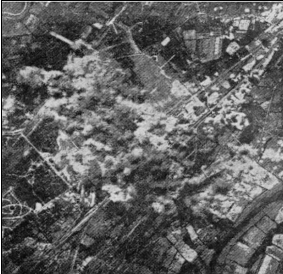
Fourth of July Fireworks