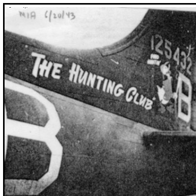
Tail Art on B-17F 42-5432 The Hunting Club