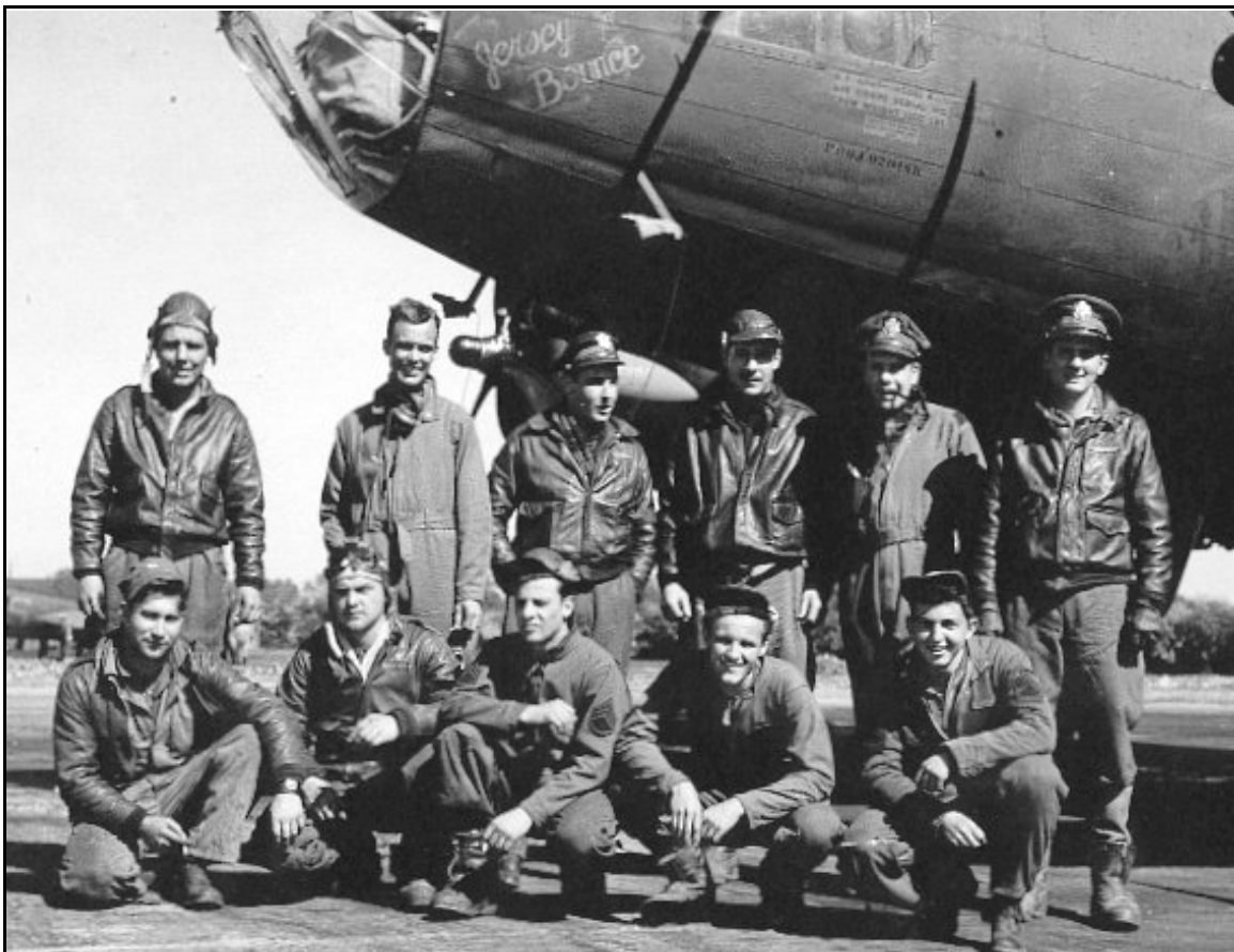
Jersey Bounce #41-24539 (358BS) VK-K