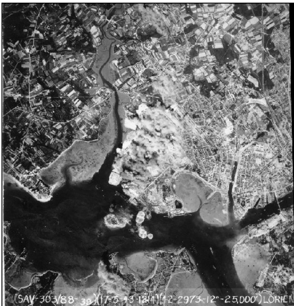
Bomb Strike photo from B-17F #42-2973 Iza Vailable