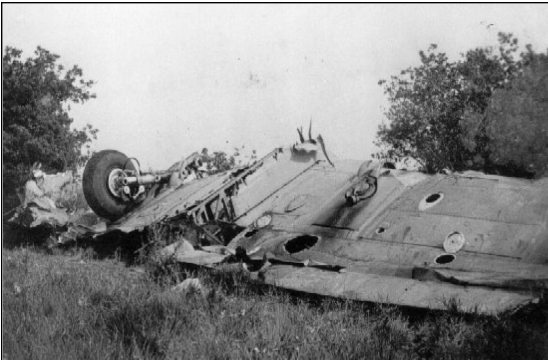
Black Swan Crash Site