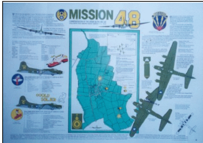
Memorial to the Crews of Ooold Soljer and Two Beauts in Mears Ashby, England. Dedicated: 31 March 1996