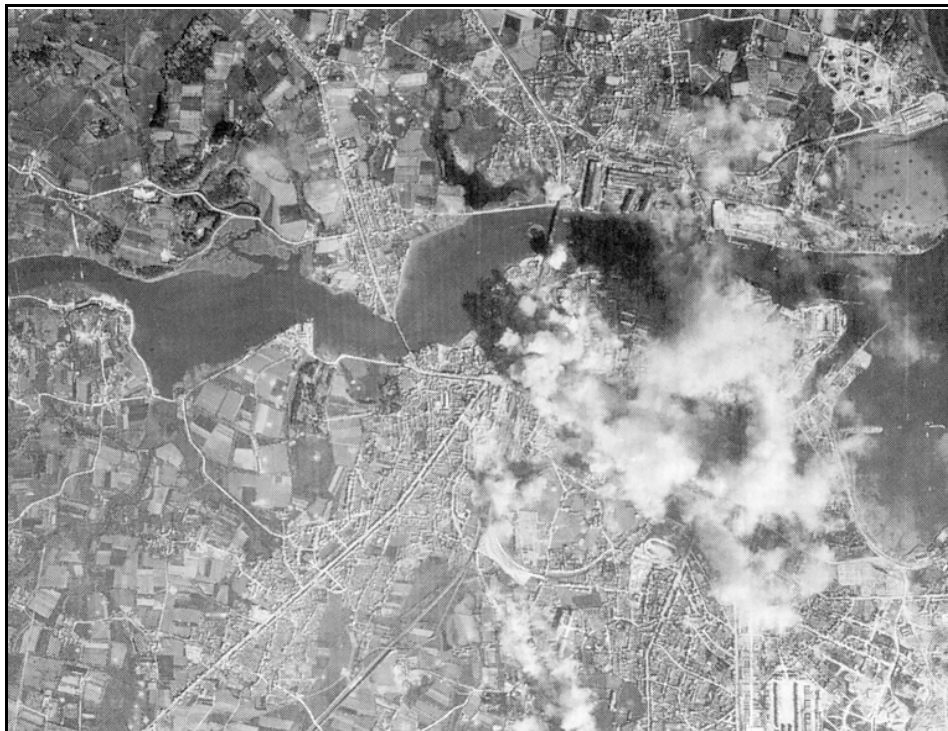
Lorient, France: Bomb Strike Photo