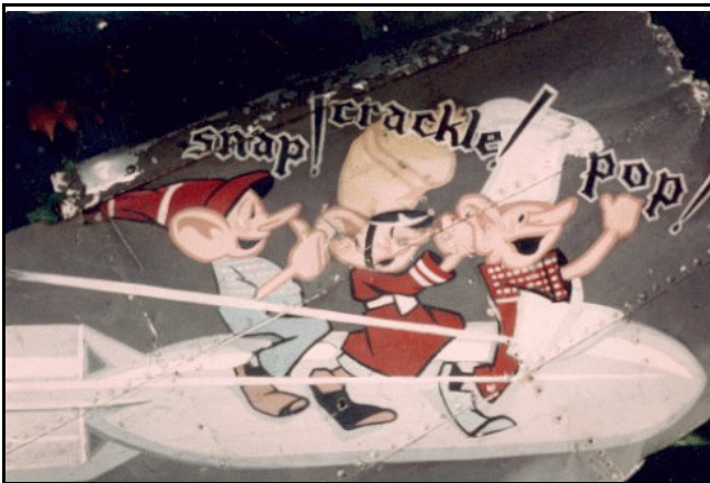
B-17F 41-24620 Snap! Crackle! Pop! 360BS PU-O Actual Nose Art panel from crashed B-17 near St. Nazaire, France