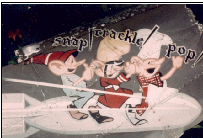
B-17F 41-24620 Snap! Crackle! Pop! 360BS PU-O Actual Nose Art panel from crashed B-17 near St. Nazaire, France