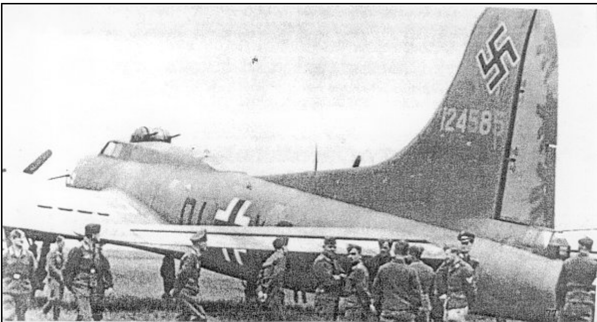
B-17F #41-24585 Wulfe Hound 360th BS (PU-B) Original 303rd BG(H) B-17F-27-B0 First 8th AF B-17 captured and flown by Germans

The Germans later were able to transport Wulfe Hound to an airfield, make repairs, and put it into flyable condition. It became part of the Luftwaffe "Kampfgeschwader" KG200 Squadron. Wulfe Hound and other American, British, and Soviet bombers and fighters of this "Spook Squadron" took part in highly secret, mysterious, and questionable operations.